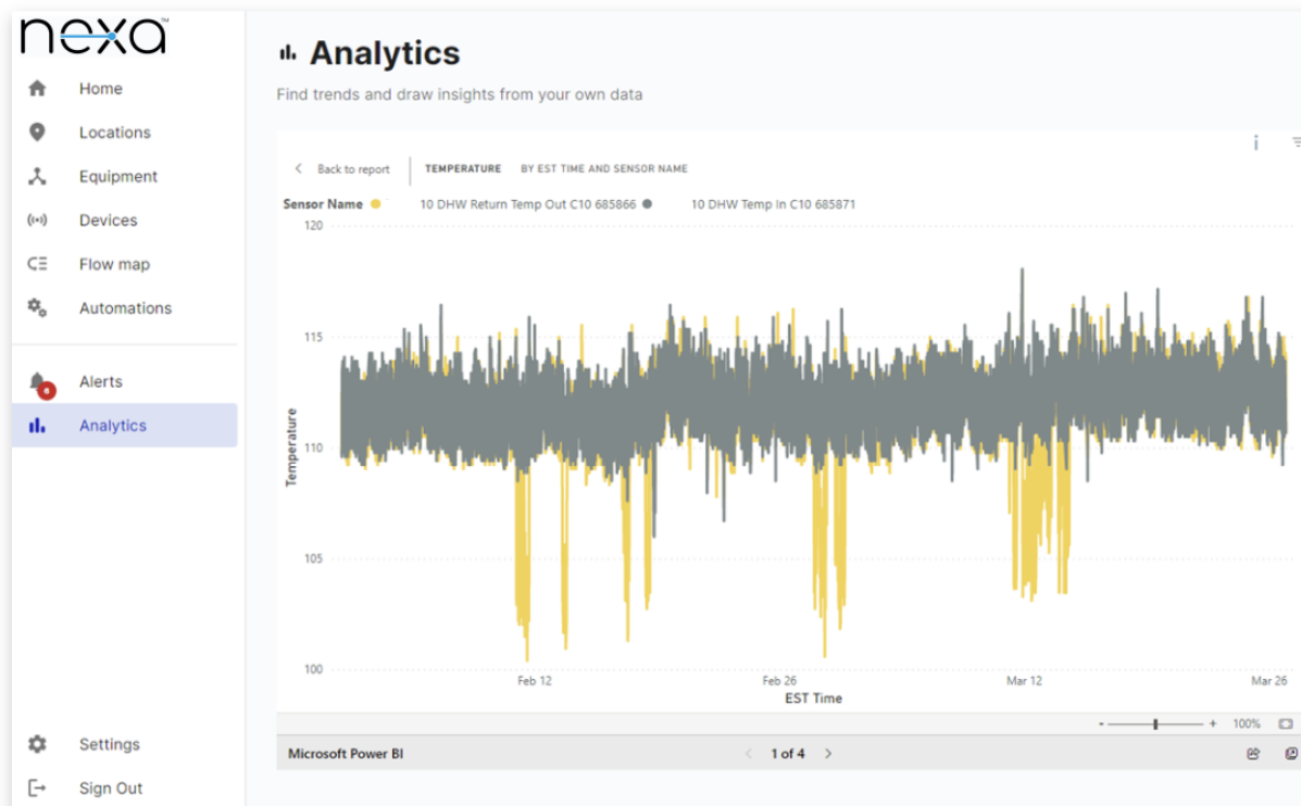
FIGURE 1 – LEAKS DETECTED IN MULTIPLE LOCATIONS, AS WELL AS A HIGH GUESTROOM TEMPERATURE ALERT

Intent was to explore where the energy loss occurred. Energy loss requires knowing the water flow rate and change in temperature. The temperature was recorded from the sensors placed on the surfaces of supply and return pipes of different branches. PowerBI within Nexa was used to find and plot the branches over the same time period. Branches 10, 11, and 12 were noteworthy given the large differences in both dTemp across the branch.